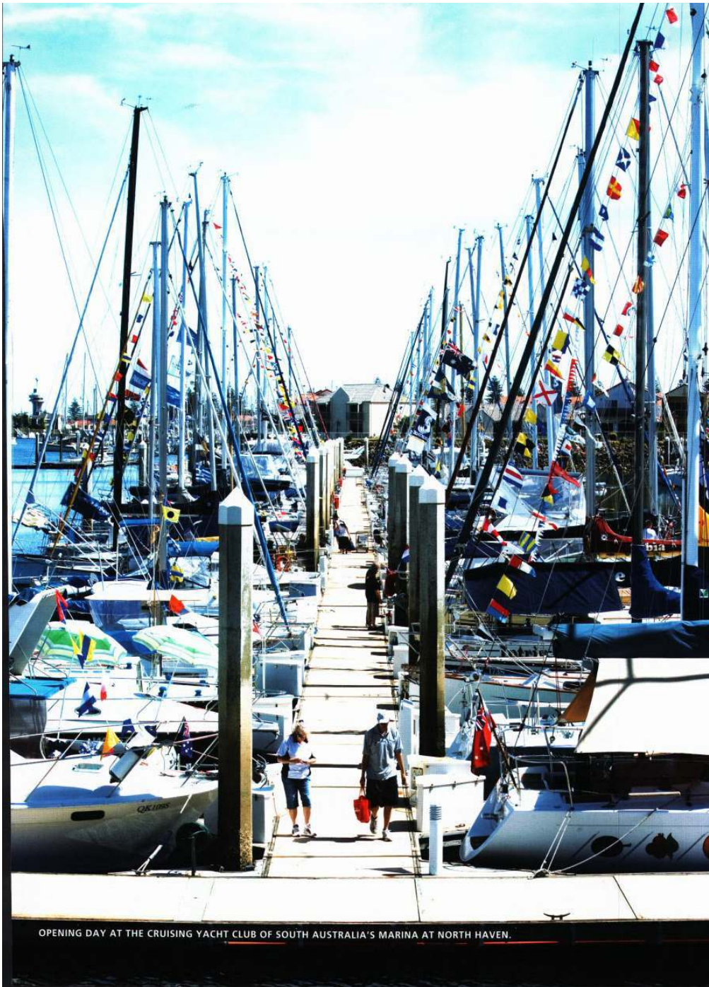
OPENING DAY AT THE CRUISING YACHT CLUB OF SOUTH AUSTRALIA'S MARINA AT NORTH HAVEN.